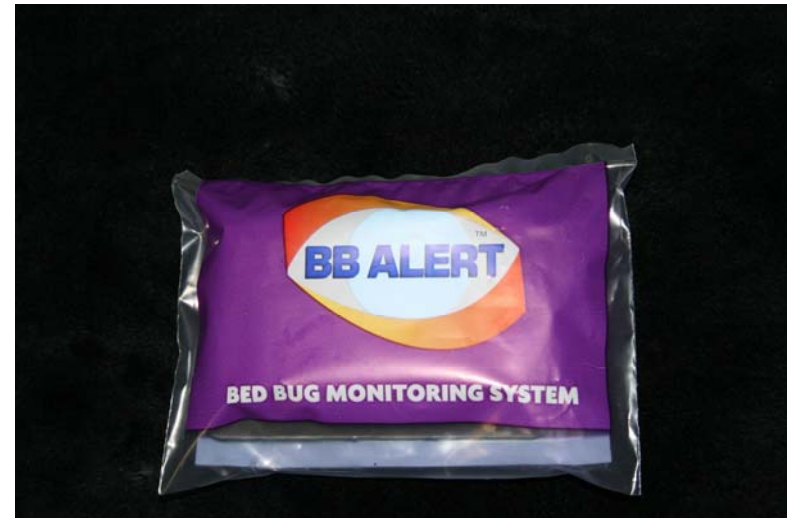
BB Alert System