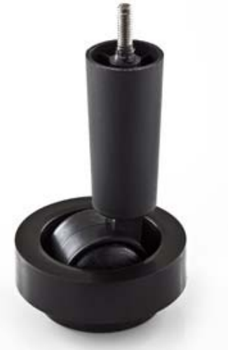
Bed Bug Barrier